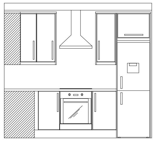
B - B